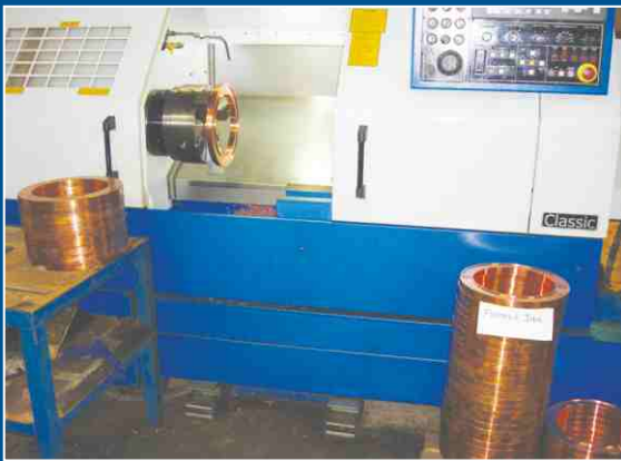
CNC Machining of Seam Welding Wheels

The greatest advantage of our forge shop is our ability to manufacture large sized flat anvil bars. Our machine shop is equipped with heavy duty double column VMC's to machine plates upto 1000mm thick x 1500mm wide x 2500mm long. Our QC Department is equipped with CMM's to measure 1000mm thick x 1500mm wide x 2500mm long bars.