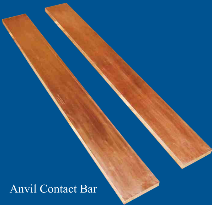
Anvil Contact Bar