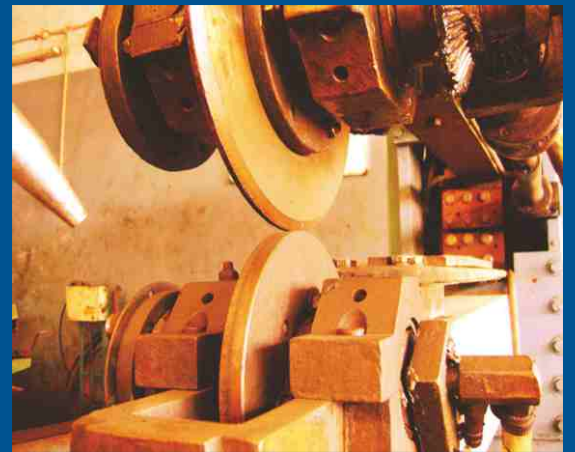
Seam Welding Machine