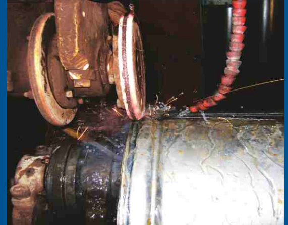
Seam Welding Process